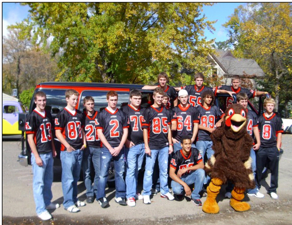
Football players posed in front of the Gobbler Van with their loyal mascot.

Last Tuesday they had their first section game of the season. The gobblers were taking on a tough team from Milaca. There were not good playing conditions for either team, the temperature was around 30 degrees and it was snowing most of the night. The power actually went out along with the whole lighting system in the second quarter bringing the game to a halt. Once they got the power back they resumed the game. The Gobblers ended up losing the game 36-0, this loss will bring the teams season to an end with a record of 3-6. The football team will be losing a lot of seniors