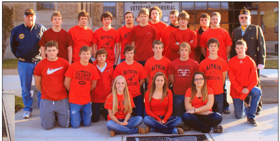
The 2013 Wrestling Team

The first match for the Gobblers will be at home on Dec 3. It will be a triangular match against Hibbing, and Rush City/Braham. All the wrestlers are looking forward for the season and are hopeful for some victories.