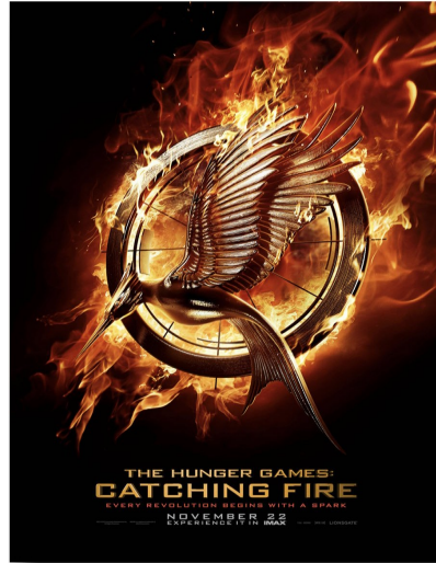
Catching Fire , starring Jennifer Lawrence ( Silver Linings Playbook ) as Katniss Everdeen, Josh Hutcherson

In Catching Fire , we return to Panem shortly after the 74 th annual Hunger Games and witness the homecoming of District 12's victors, Katniss Everdeen and Peeta Mellark. After a brief time with their families, Katniss and Peeta are forced to participate in the Quarter Quell, a special version of the Hunger Games which occurs every 25 years.