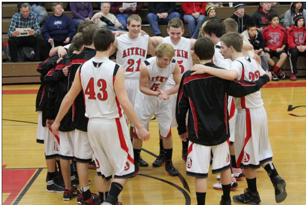
Guys get pumped up before the big game!

was injured during football season and had to get surgery