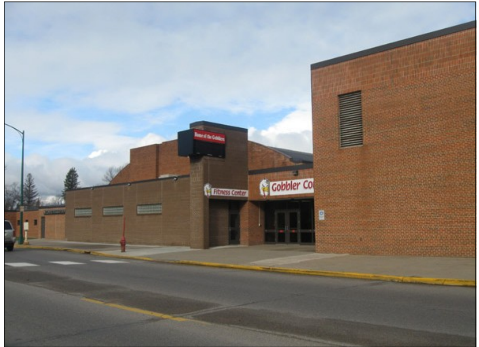
Aitkin High School.