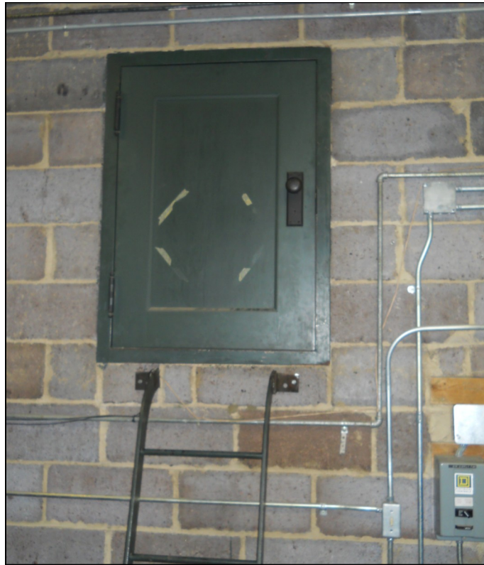
The door leading to the ceiling of the auditorium.