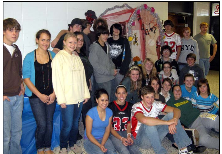
The Spanish Club getting ready to celebrate Day of the Dead

Every event that the club will do this year will help raise awareness for the Latin culture, such as Hispanic Heritage month, Day of the Dead, and Mothers Day. Cinco de Mayo is one of the most famous Hispanic celebrations, and Spanish Club will put on a great dinner that night. All the food that will be served will be from a South American country like salad from Chile, and other meals from Honduras, and Mexico. The group will take a trip to El Tequila in Brainerd, also three piñatas will be given away, along with a $300 scholarship for a student that plans